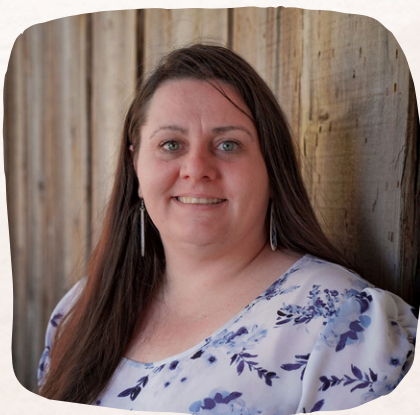
Family and Community Partnerships Coordinator

My approach to working with adult learners includes home visiting, conducting needs assessments, and motivational interviewing. I collaborate with families to identify and support their goals while respecting their rights to self-determination. I provide information and referrals that can empower families to increase their economic mobility, self-reliance, and family well-being. My educational background is a Bachelor's degree in Community Crime Prevention with a minor degree in Legal Studies. I have college certificates in Supervision and Early Childhood Education Preschool. I have achieved Oregon Registry Step 10 certification with more than 1,556 training hours in the field of childhood care and education. My Qualified Mental Health Associate credential is under the taxonomies of counseling and case management. My career has spanned 20 years of experience working in community and human services, including 8 years' experience in leadership/program coordination roles and over 8 years of experience in Head Start/EHS programs. I have skills in resource information and referral, domestic violence advocacy, positive youth development, health promotion and outcome measurement and statistical reporting.