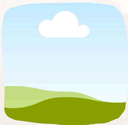
Family Partnership Specialist